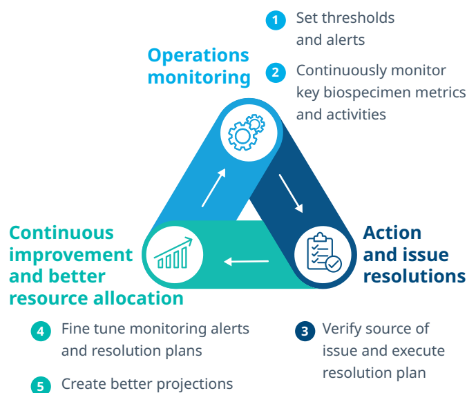
Figure 3: Biospecimen operations monitoring lifecycle

Labmatrix® allowed flexible sample and consent reconciliation with either pre-defined or ad-hoc reports. Here are some examples of the information made available to the client through Labmatrix®'s out-of-box and configurable dashboards and reports: